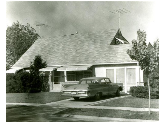
195 Washington, Park Forest, Illinois 60466

If you have questions about what the building features can be developed, please visit the Building Department to learn more.