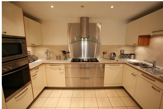
Kitchens can include plumbing, electrical, natural gas, and ventilations systems